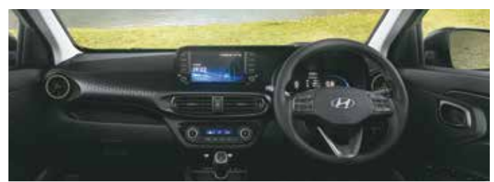
Black interiors with light sage inserts