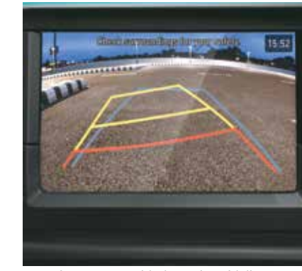
Rear view camera with dynamic guidelines