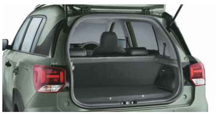
Ample boot space

Hyundai EXTER Hy-CNG duo is engineered to optimize every journey. Equipped with a dual-cylinder system, it offers more boot space and enhanced efficiency. This SUV ensures you have all the room you need for your adventures while delivering exceptional performance.