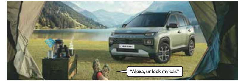
Home to car (H2C) with Alexa*** (English & Hindi)