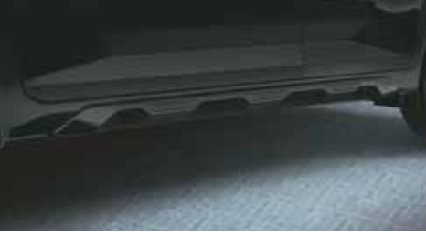
Black painted side sill garnish