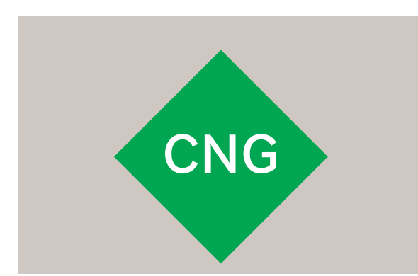
1.2 | Bi-fuel Kappa petrol with CNG