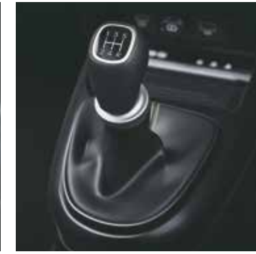
Manual transmission (MT)