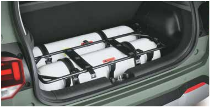
Company fitted dual cylinder CNG