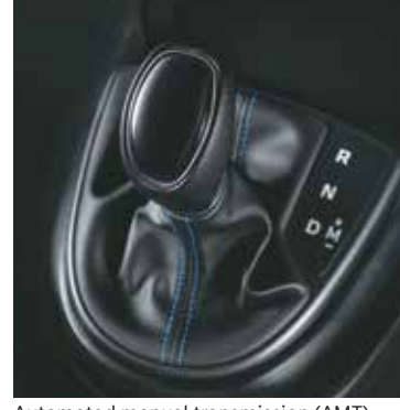
Automated manual transmission (AMT)