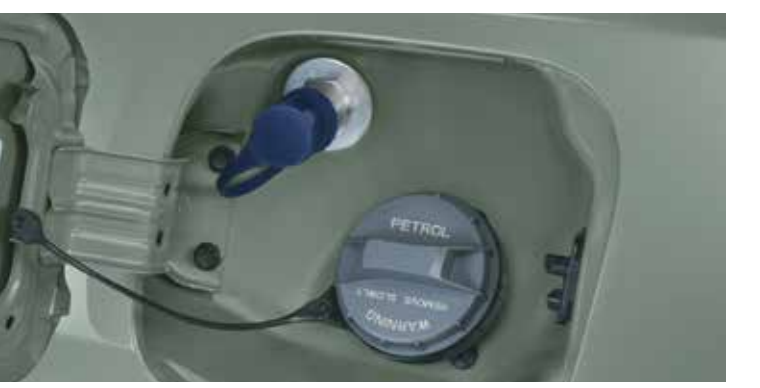
Convenient CNG filling with fast refueling nozzle (near petrol filling area)