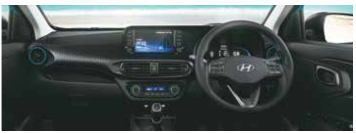
Black interiors with cosmic blue inserts