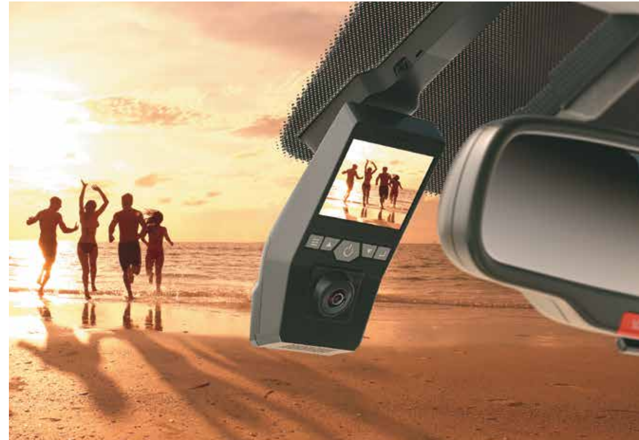
Dashcam with dual camera

Hyundai EXTER comes equipped with a host of high-tech features, so you have absolute control over your many worlds even when on the go. From on-board navigation, smartphone connectivity to infotainment with multiple regional UI language support, Hyundai EXTER has everything to ensure you never miss anything when you are exploring outside.